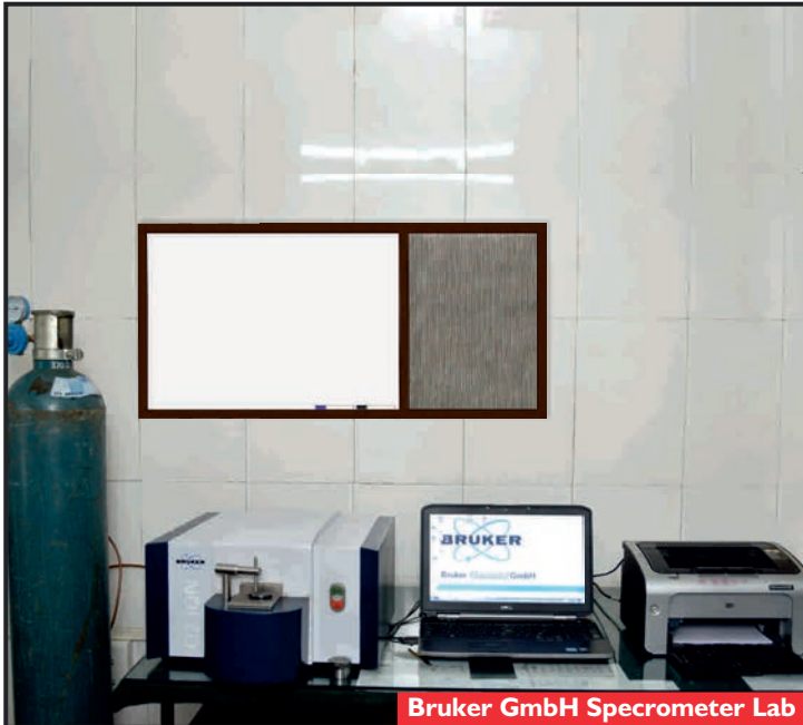
Bruker GmbH Specrometer Lab