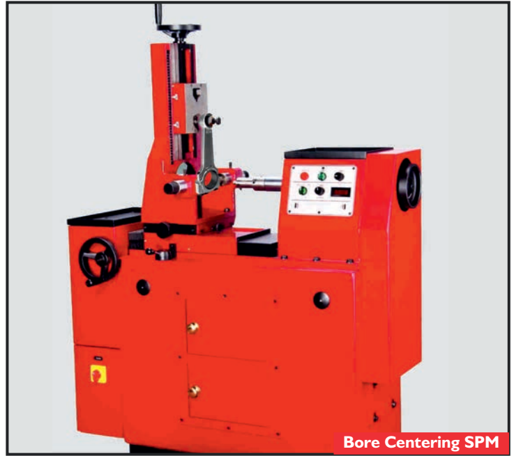
Bore Centering SPM