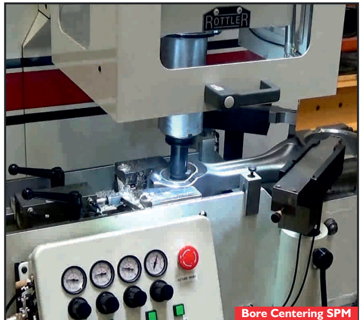
Bore Centering SPM